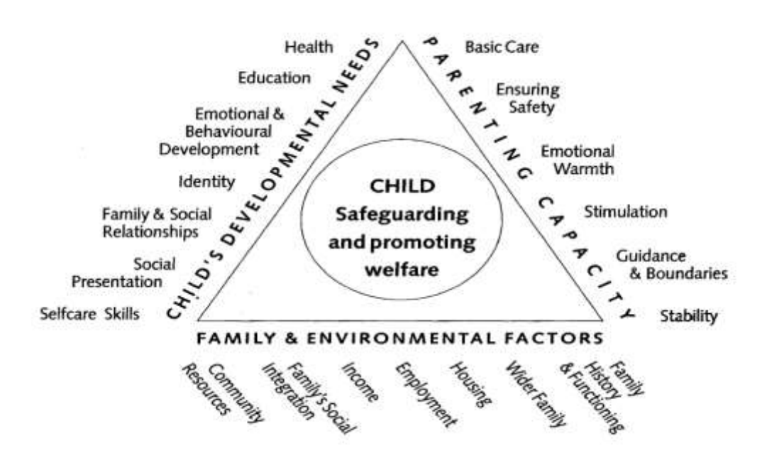
Working Together to Safeguard Children (DFE, 2015)