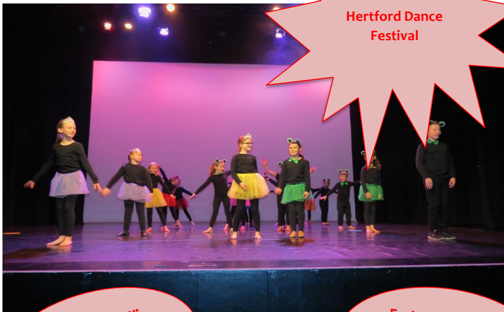
Hertford Dance Festival