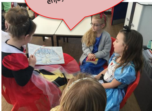
World Book Day: Pupils in Years 1 and 5 enjoying a shared story