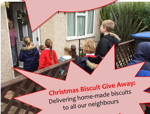
Christmas Biscuit Give Away: Delivering home-made biscuits to all our neighbours