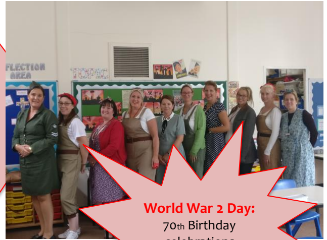
World War 2 Day: 70 th Birthday celebrations