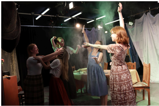
A-Level Punch Drunk Inspired Reinterpretation of Dancing at Lughnasa by Brian Friel

A-Level students also study the EDUQAS Drama and Theatre specification, exploring a range of theatre styles and texts. Set texts include Chimerica by Lucy Kirkwood and Hedda Gabler by Henrik Ibsen. Students are taught the theatre styles of Brecht, Stanislavski, Gecko, Punchdrunk, Headlong and Complicité. Students are influenced by theatre companies and practitioners to create their own practical performance work inspired by various methodology, skills and techniques. This is an exciting and creative process and students have produced exceptional work in this unit over the years.