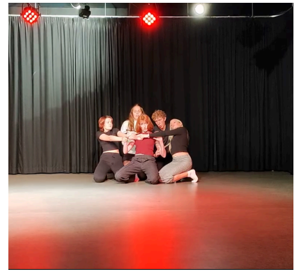
A-Level Gecko Inspired Reinterpretation of Chimerica by Lucy Kirkwood