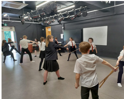
Year 8 Able and Ambitious club exploring Stage Fighting