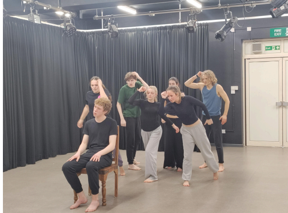
A Level students taking part in a Gecko Theatre Company workshop in February 2024.