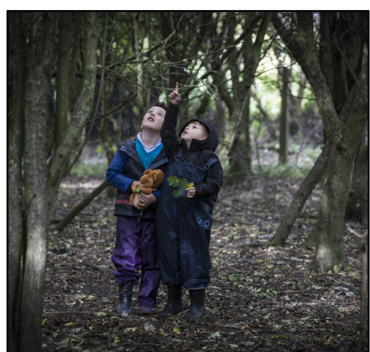
We encourage environmentally and community friendly travel to school and have achieved a silver "Modeshift Stars" national travel award for our work on sustainable travel to school.